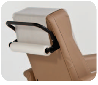
Acts as a shield against the spread of unwanted bacteria. Additional protection to patient as well as the recliner.